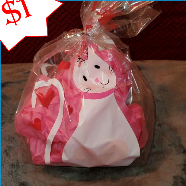
Bags Includes candy