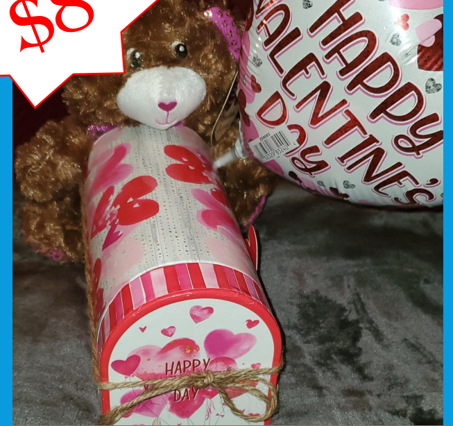
Mailboxes Includes stuffed animal, balloon, and mailbox full of candy & goodies