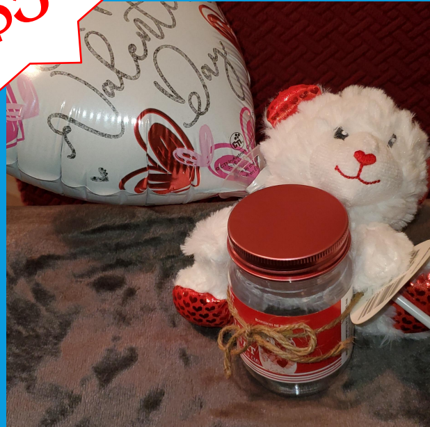
Jars Includes stuffed animal, balloon, and jar of candy & goodies